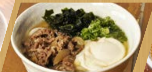
Niku Udon 14

Beef, poached egg, wakame seaweed and green onions