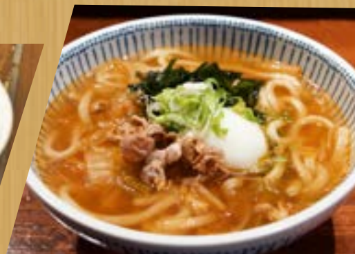
Kimchi Udon 14

Beef, poached egg, wakame seaweed and green onions