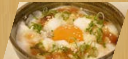
Tamago Don 17