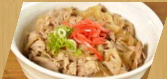
Gyu Don 18

Marinated beef and onion with dashi broth