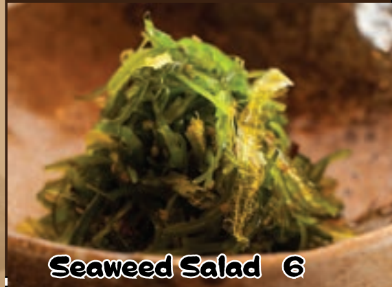
Seaweed Salad 6

Your choice of 3 from our 5 kinds of quick appetizers for only $12