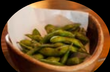
Yaki Edamame 8 Stir fried Edamame with Salt & Butter