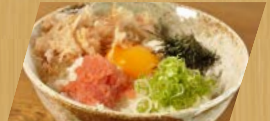
Mendai Tamago Don 10

Marinated beef and onion with dashi broth