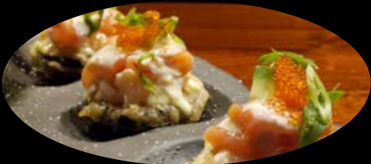
Crispy Sushi Canape 13 Chop scallop, salmon or tuna, avocado tobiko and green onion with yuzu wasabi mayo sauce on a crispy rice base