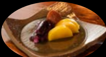
Tsukemono 5 Japanese pickles