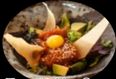
Tuna Yukke 8 Tuna tartar with quail egg, sesame seed and avocado