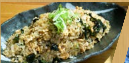
Garlic Salmon 13

Salmon, garlic, onions and wakame seaweed