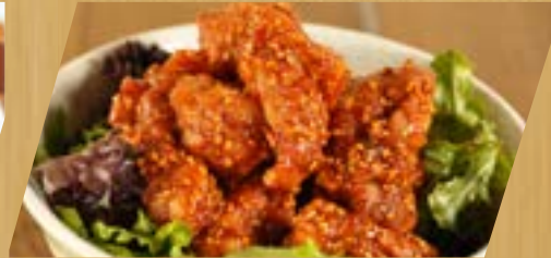
Spicy Chicken Don 18

Pork or Chicken cutlet with fluffy dashi egg