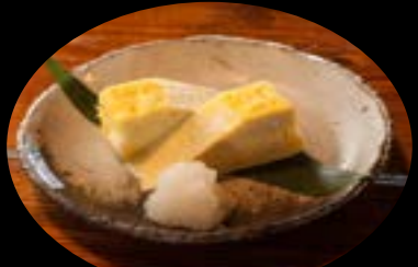
Dashimaki 5 Egg omelette with Japanese dashi broth