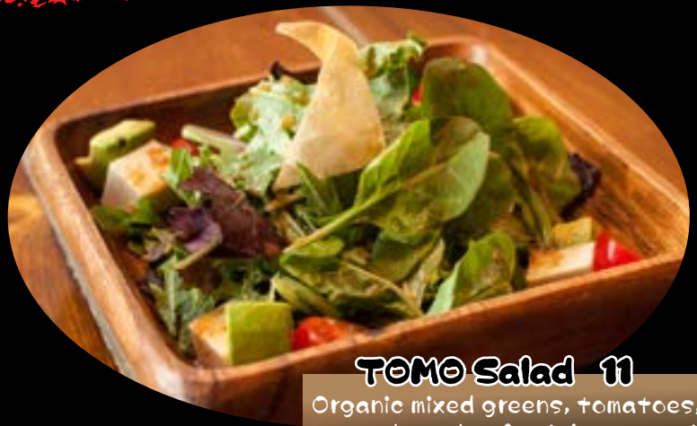
TOMO Salad 11

Smoked salmon, cucumbers, avocado, daikon radish, mayo and organic mixed greens with special dressing