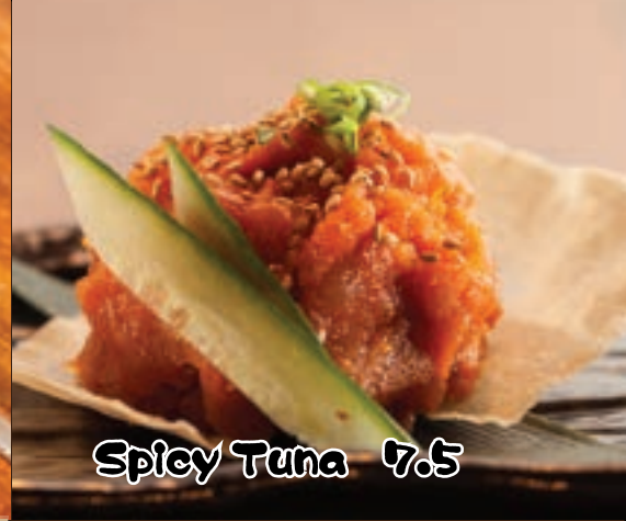
Spicy Tuna 7.5