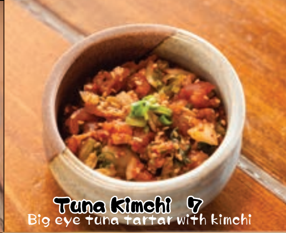
Tuna Kimchi 7 Big eye tuna tartar with kimchi