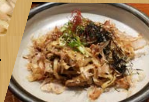
Negi Shio Pork 14

Olive oil, bacon, chili pepper, octopus, squid and onions