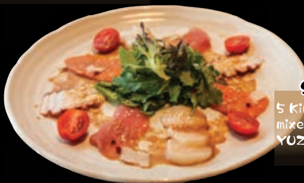
Seafood Carpaccio 13

Organic mixed greens, tomatoes, avocado and tofu with our special YUZU dressing