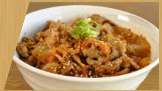
Kimchi Pork Don 18

Stir-fried pork, kimchi and onion with sesame oil and sesame seed