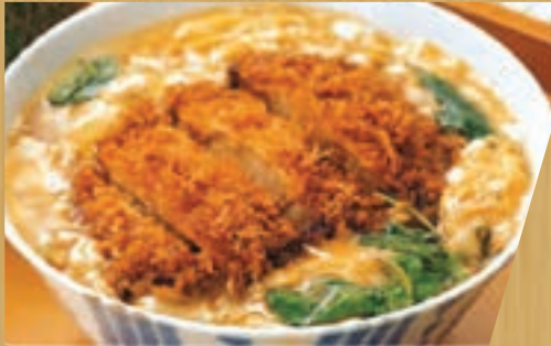
Katsu Don 18

Pork or Chicken cutlet with fluffy dashi egg