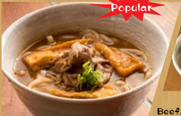
Curry Udon 14