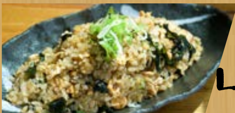
Lobster Risotto 35

Kimchi, bacon, pork, onions, garlic, egg, sesame oil